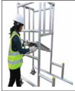
Step 3 Position platform on the 3 rd rung from the top. Apply wind lock. See Illustration 3