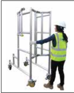
Step 1 Unfold the podium foldable frame on a firm and level ground and lock the folding gate mechanism See Illustration

The law requires that the personnel erecting, dismantling or altering the PODIUM must be competent. Any person erecting Ascend PODIUM must have a copy of this guide.