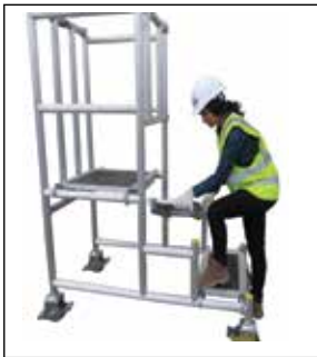
Step 4 Place steps on 1 st and 2 nd rung and engage the windlock As Illustration 3