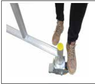
Step 2 Lock all castor wheels See Illustration 4