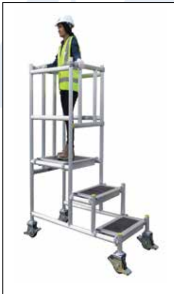
The Complete Structure